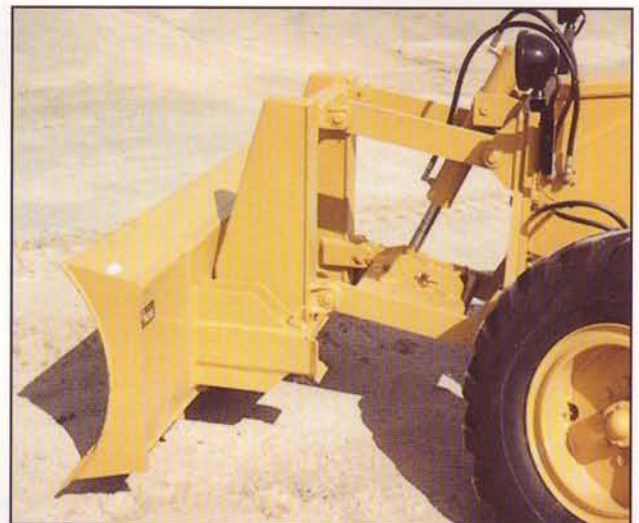
RYBIND FRONT-SCARIFIER MOUNTING SHOWN