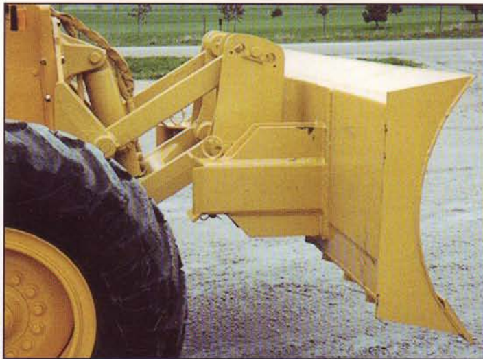
JOHN DEERE FRONT-SCARIFIER MOUNTING SHOWN